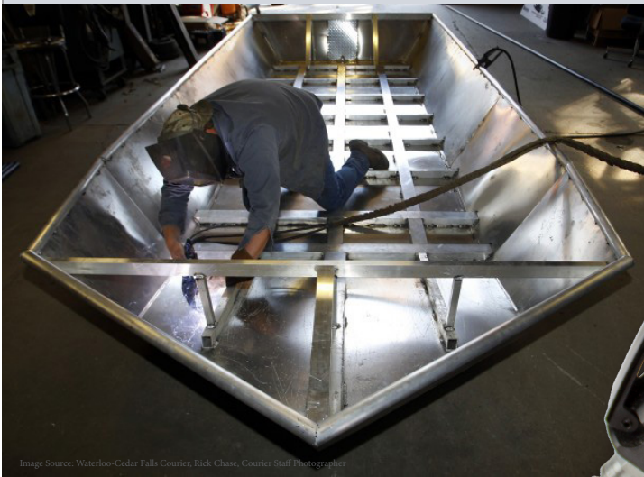
For Production Use or Rework/Repair

The first industrial-grade and compliant tool design ensures fast and effective back-gouging for reducing porosity along aluminum seam lines.