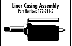
Liner Casing Assembly Part Number: 172-911-5